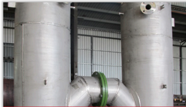
Stainless Steel 316L Process Tank