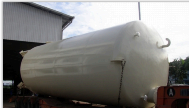
Carbon Steel Glue Tank