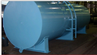
Raw Water Tank