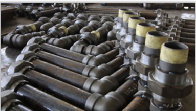
Hard Steam Piping