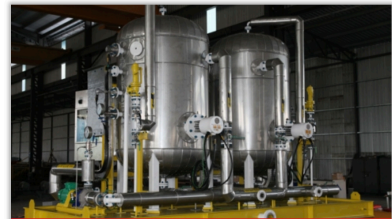
Stainless Steel 316L Skid Package for Petronas Malaysia