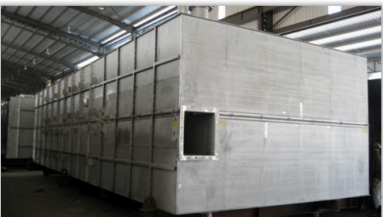
Stainless Steel 316L Steller Tank