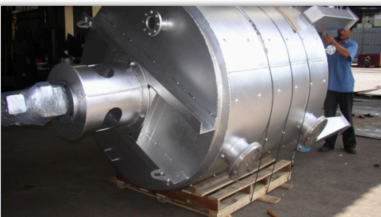
Stainless Steel Mixing Tank